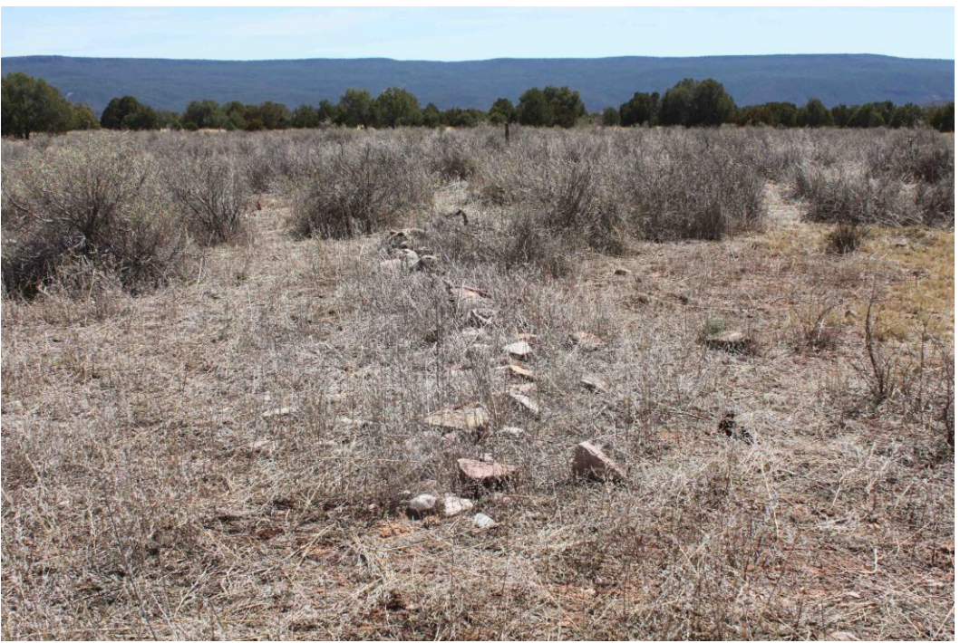
Fig. 18: Landscape view just east of the ruins, facing south (Starr Herr-Cardillo, 3/17/14).