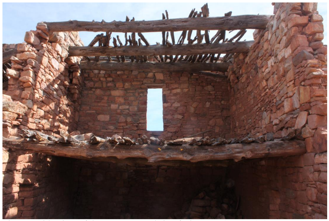
Fig. 8: Inside view of the reconstructed site, facing east (Group I) (Starr Herr-Cardillo, 3/17/14).