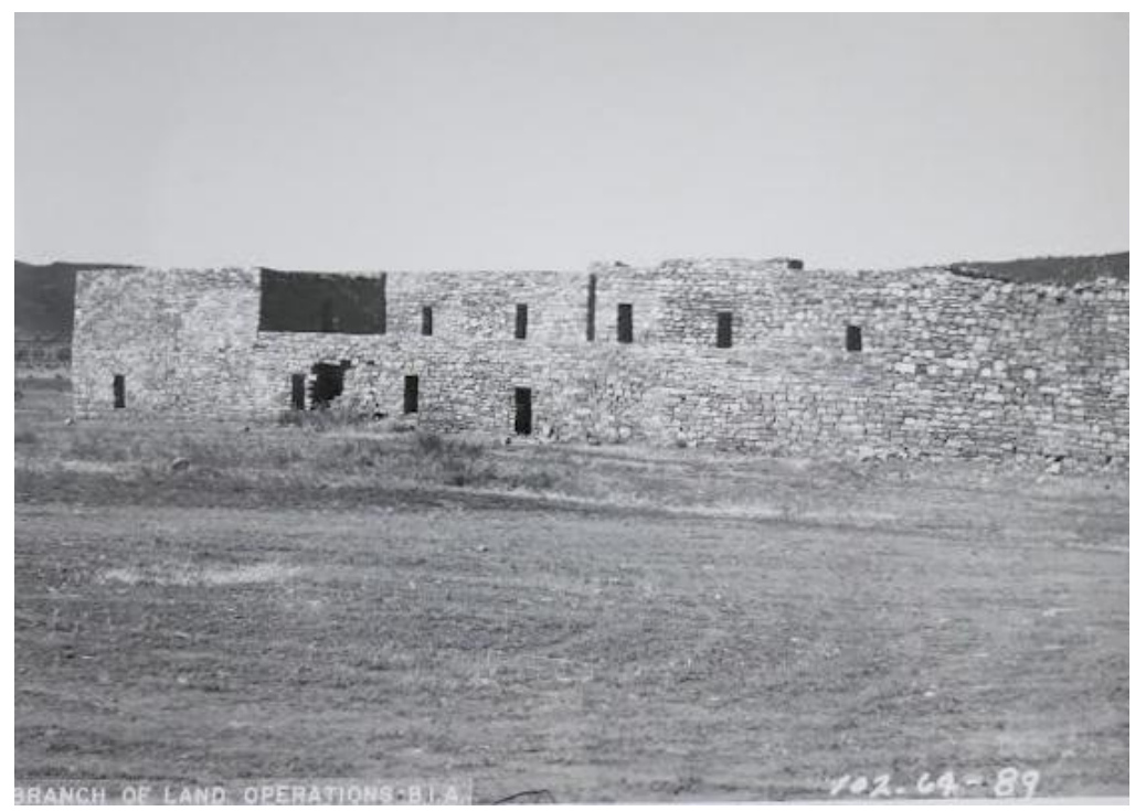
Fig. 20: View of the reconstructed portion of Group I, facing west, with access road in front.