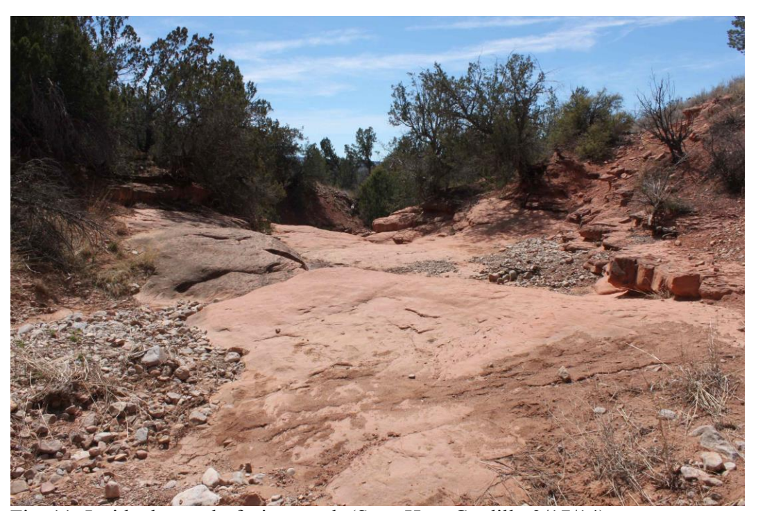
Fig. 11: Inside the wash, facing south (Starr Herr-Cardillo 3/17/14).