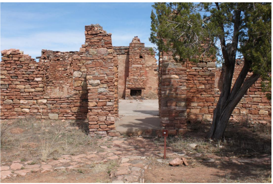
Fig. 15: View of remnants of the Museum building facing north (Starr Herr-Cardillo, 3/17/14).