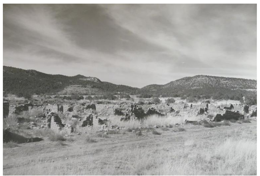
Fig. 22: View of the excavated site, facing west towards upper drainage; note road adjacent to site (Albert Schroeder, 1955, Courtesy of WACC).