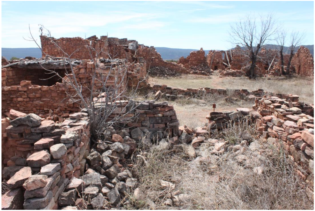
Fig. 9: View across the plaza of the excavated site, facing south (Starr Herr-Cardillo, 3/17/14).