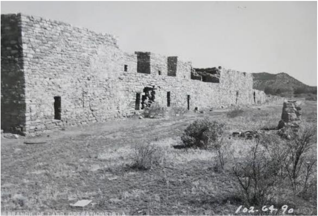
Fig. 19: View of the reconstructed portion of Group I, facing northwest. Note the presence of the New Deal barbecue (Photographer unknown; Photo courtesy of the Fort Apache Heritage Foundation).