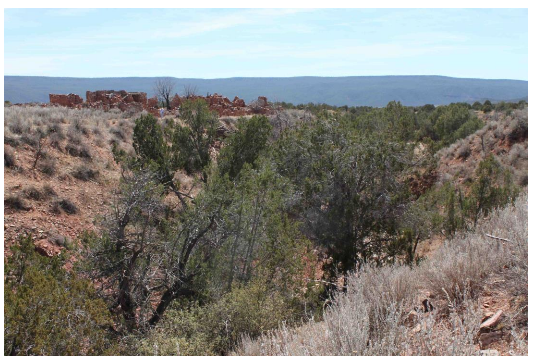
Fig. 14: View of Group I from across the wash, facing southeast (Starr Herr-Cardillo, 3/17/14).