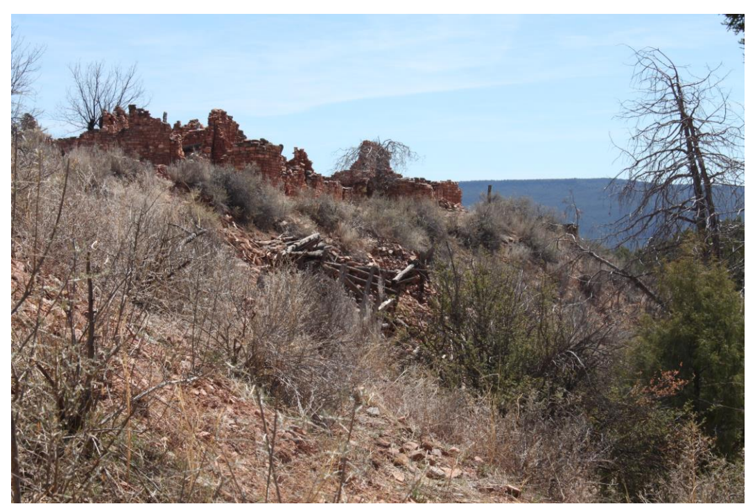
Fig. 10: View from the wash between the excavated and non-excavated sites, facing southeast (Starr Herr-Cardillo, 3/17/14).