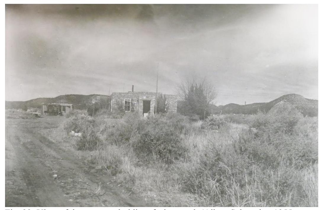
Fig. 23: View of the museum building, facing north (Albert Schroeder, 1955, Courtesy of WACC).