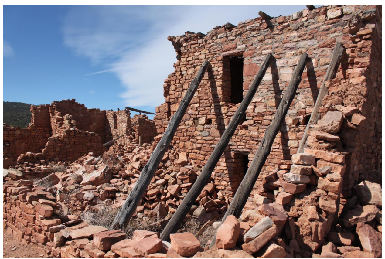
Fig. 6: Southeastern end of excavated site (Group I) showing reconstructed ruins, facing northwest (Starr Herr-Cardillo, 3/17/14).