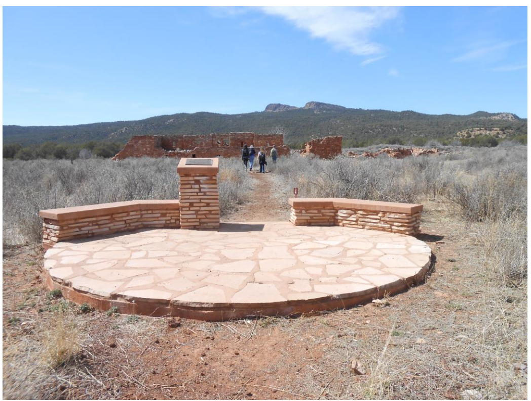
Fig. 5: National Landmark sign and pavilion at site entrance, facing west (Allison Dunn, 3/17/14).