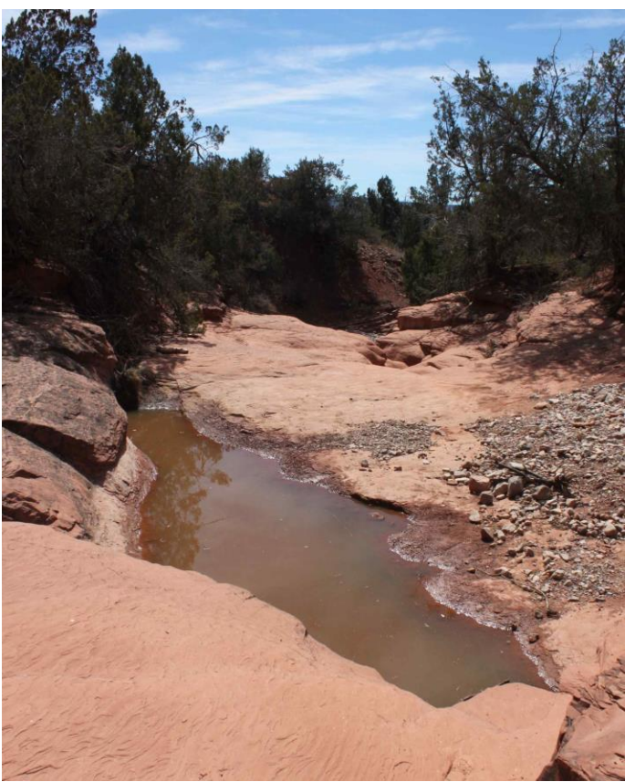
Fig. 13: View of bedrock depression holding water, facing south (Starr Herr-Cardillo, 3/17/14).