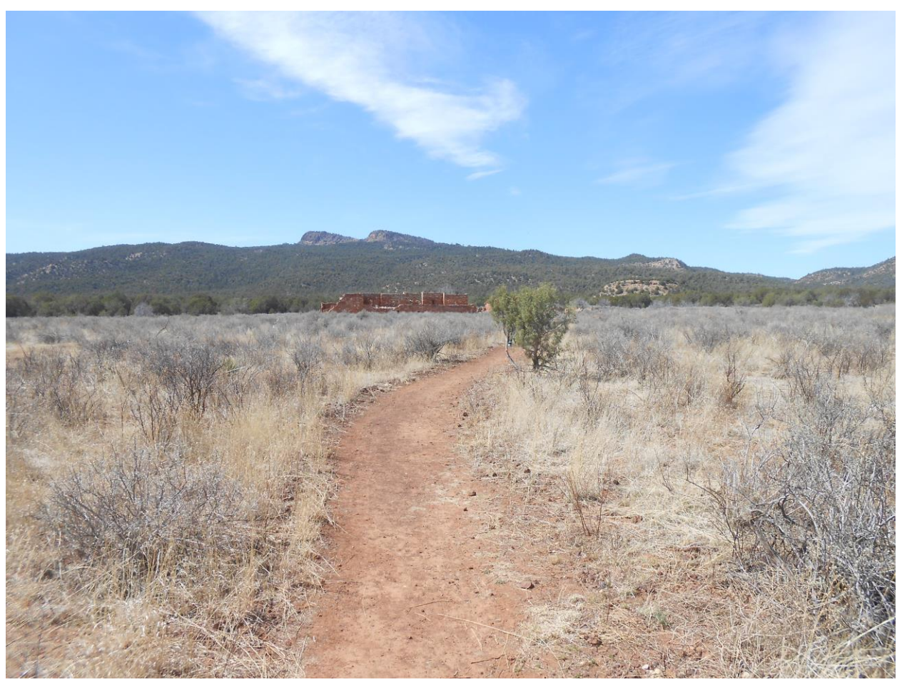
Fig. 3: Approaching the site from the parking lot, facing west (Alison Dunn, 3/17/14).