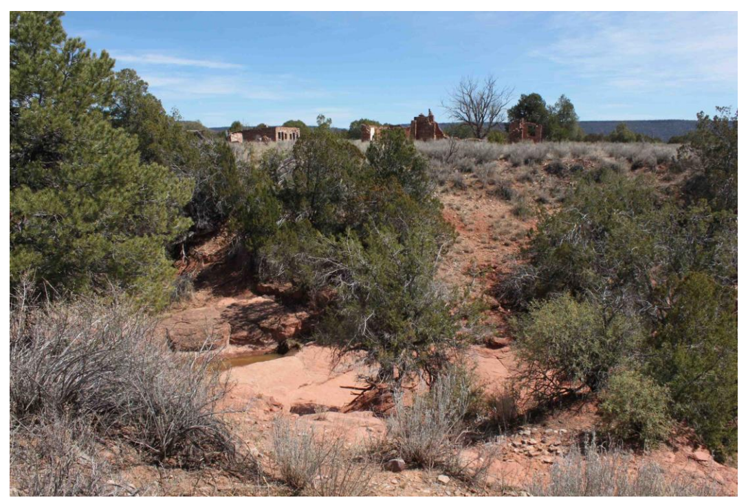
Fig. 16: View of the Museum and Guest House from the west side of the wash, facing northeast (Starr Herr-Cardillo 3/17/14).