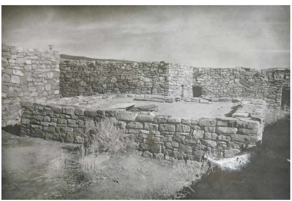
Fig. 21: Inside the reconstructed plaza in Group I (Albert Schroeder, 1955, Courtesy of WACC).