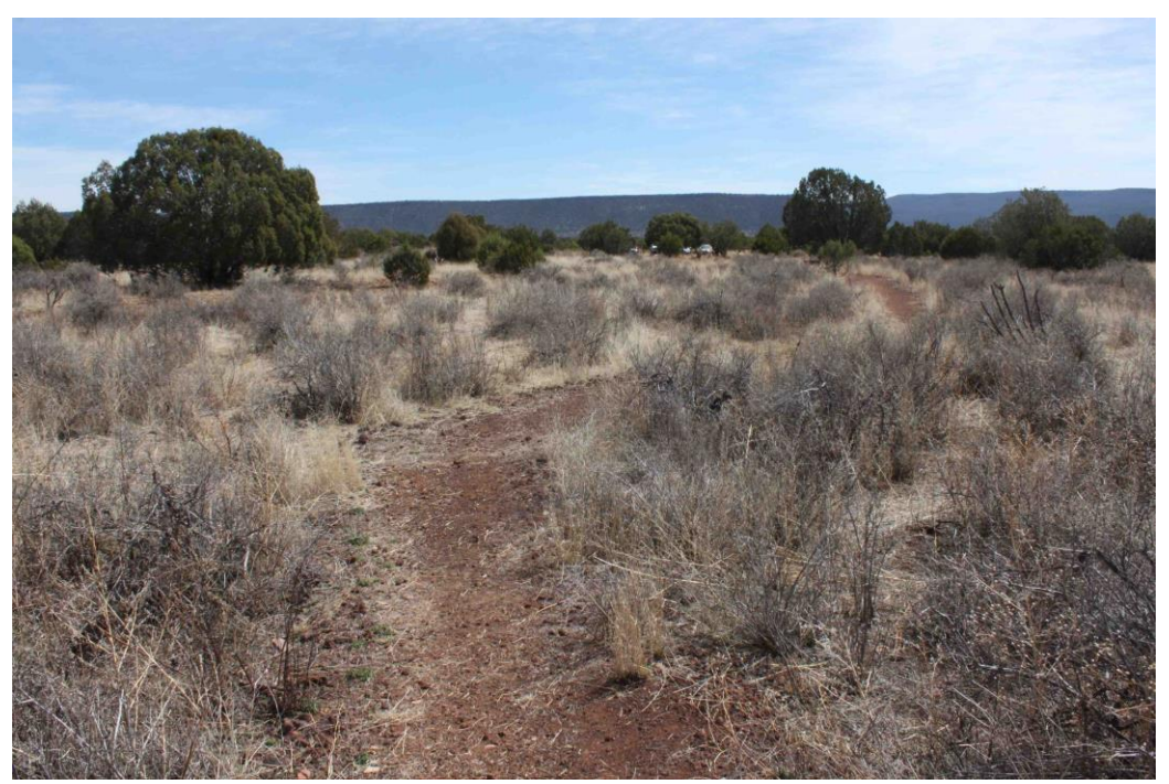
Fig. 4: Looking east towards the parking lot from viewing platform. (Starr Herr-Cardillo, 3/17/14).