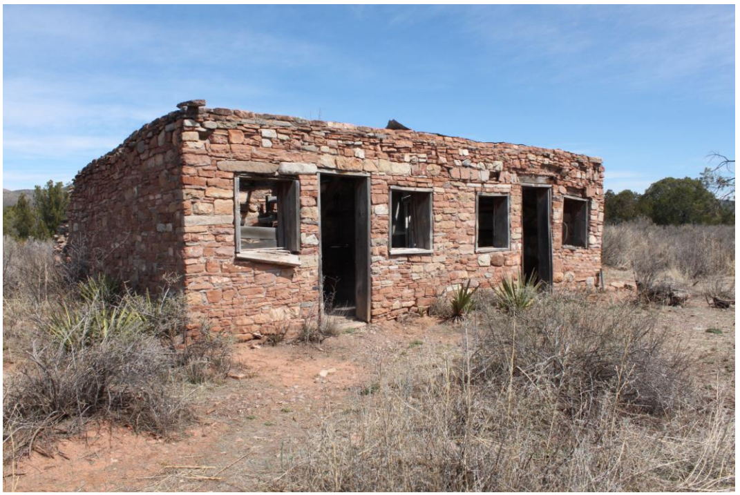
Fig. 17: View of the Guest House facing northwest (Starr Herr-Cardillo, 3/17/14).