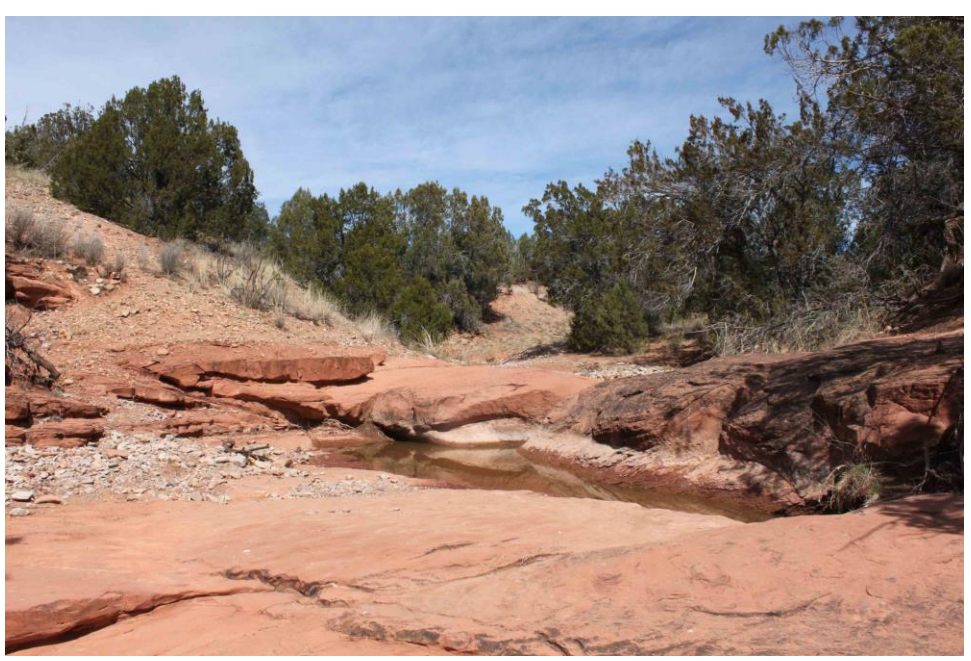
Fig.12: View from inside the wash, facing north (Starr Herr-Cardillo 3/17/14).