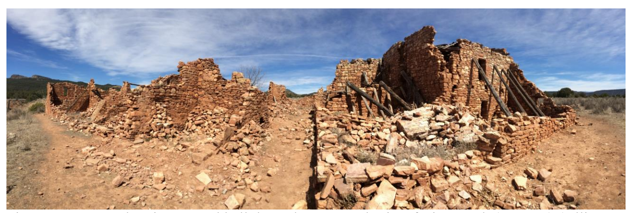
Fig. 7: Panorama showing central hall through excavated ruins, facing north (Group I) (Allison Dunn, 3/17/14).